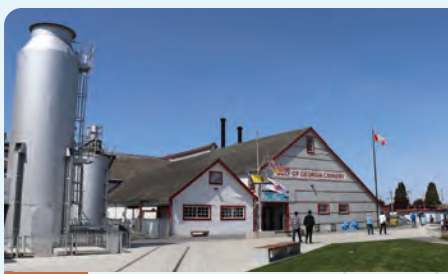
Gulf of Georgia Cannery Museum

G&F Financial Group commends the Society’s efforts to preserve and share their local history. We are proud to have the Gulf of Georgia Cannery Society as our member.