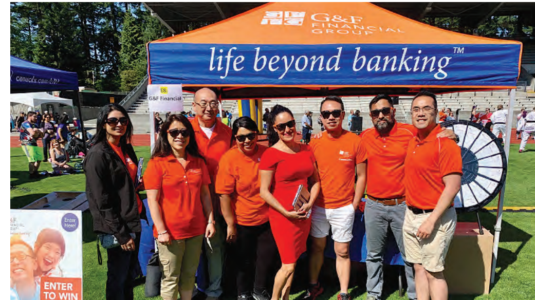
Supporting the Canucks Autism Network at the Rubber Ducky Race